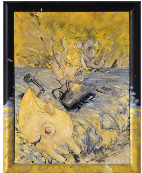
Das Süßeste vom Süßen , 1966, Acrylic on canvas, artist's frame 152 x 152 cm / 59.84 x 59.84 inches; Torte mit Speisekugeln und Speiseblau (Backe, Backe Kuchen) , 1966, Collage with illustrated images, rain-bow-colored Speisekugeln (crayon on cardboard) and casein on cardboard 57 x 57 cm / 22.44 x 22.44 inches; Elvis-Stelzengliedschmuck , 1970, Mixed media on cardboard, 80 x 105 cm / 31.5 x 41.34 inches; Euterscheuche , 1980, Acrylic and lacquer on canvas, artist's frame, 120.5 x 95.5 cm / 47.44 x 37.6 inches

For more information on the gallery and its artists and activities please visit www.gmurzynska.com