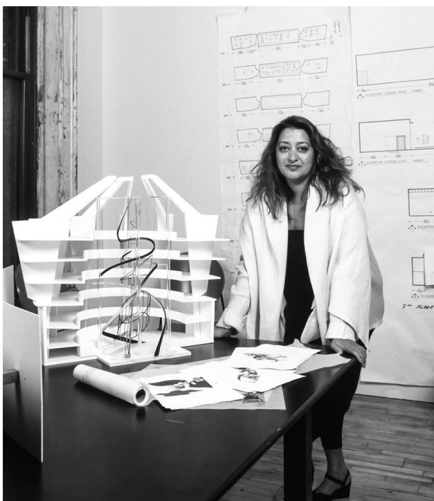
The Great Utopia: The Russian and Soviet Avant-Garde, 1915–1932, 1992/93

For more information on the gallery and its artists and activities please visit www.gmurzynska.com