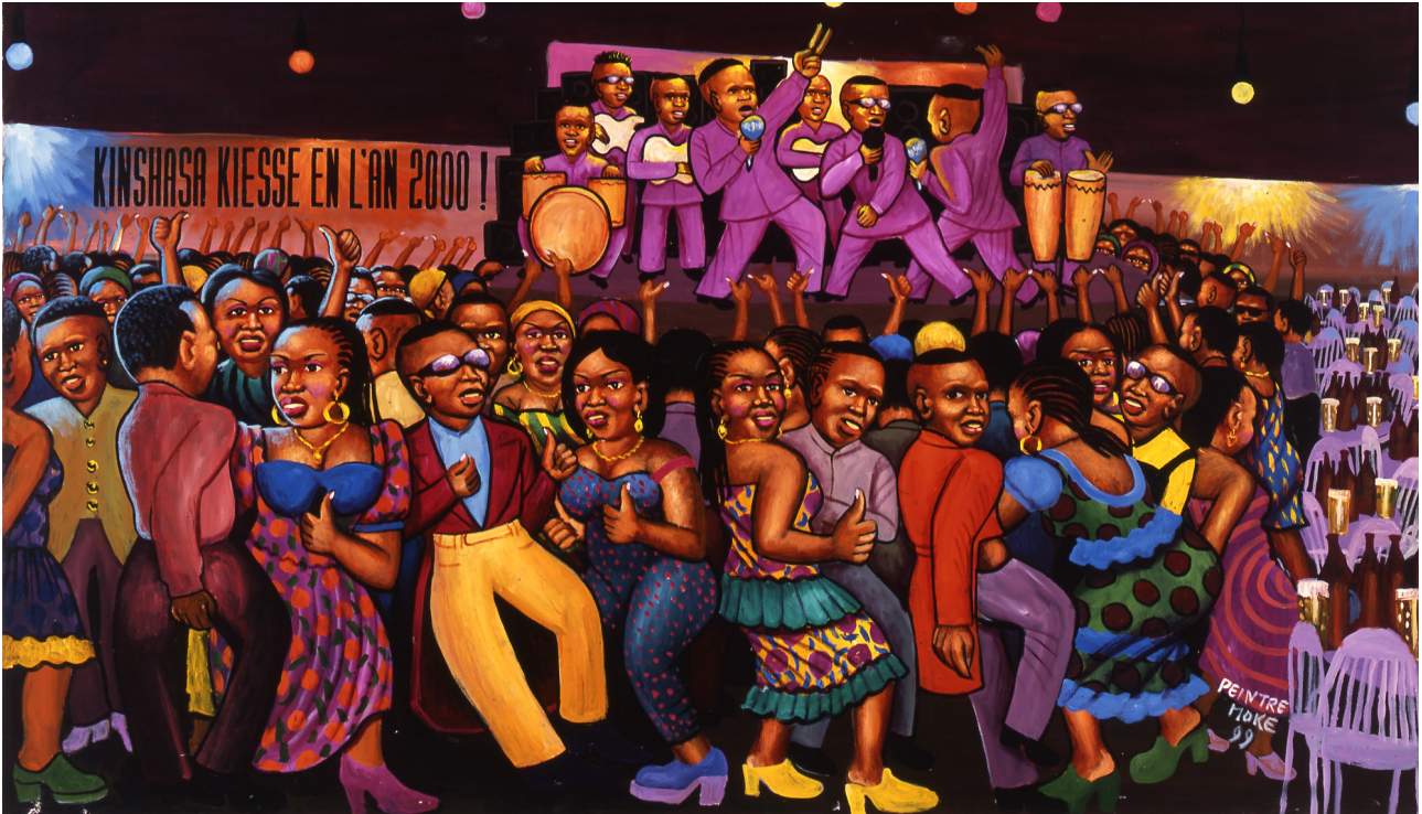
Moké, La nuit chaude a la cité , 1999