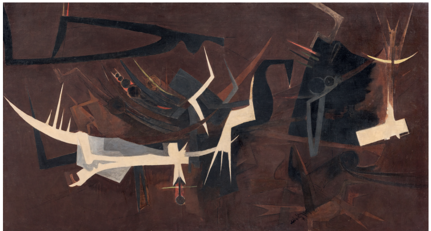
Wifredo Lam, [Portrait Surréaliste] 1974, and Les Oiseaux blancs 1969