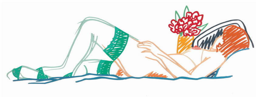
Tom Wesselmann, Nude with Bouquet and Stockings (#5) , 1985