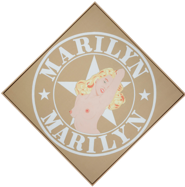
Robert Rauschenberg, Marilyn Marilyn II , 1999