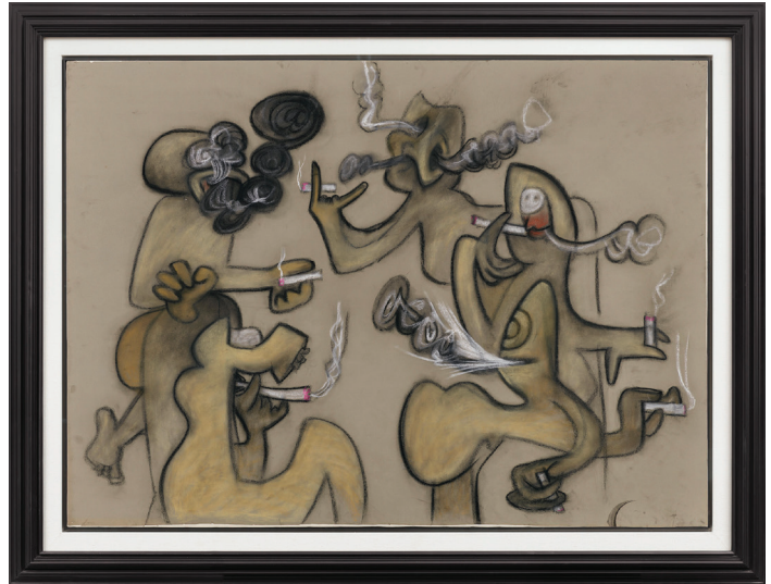
Roberto Matta, Sans Titre (Pour que la liberté ne se transforme pas en statue) 1965, and Untitled 1970

Roberto Matta, Chilean Surrealist and early mentor to the New York Surrealist movement, explored new ways of rendering the Space, achieving new means in depicting three dimensional forms, combining an aesthetic of pure abstraction with elements of figuration.