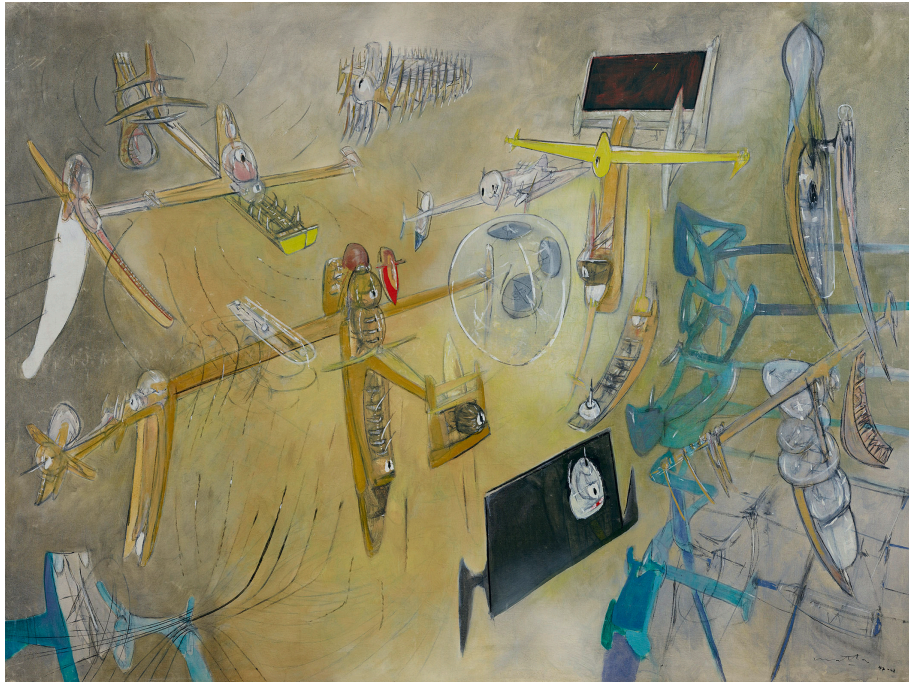
Roberto Matta, Les Témoins de l'univers , 1948

December 6 – 9, 2018 | Booth B1 Miami Beach Convention Center