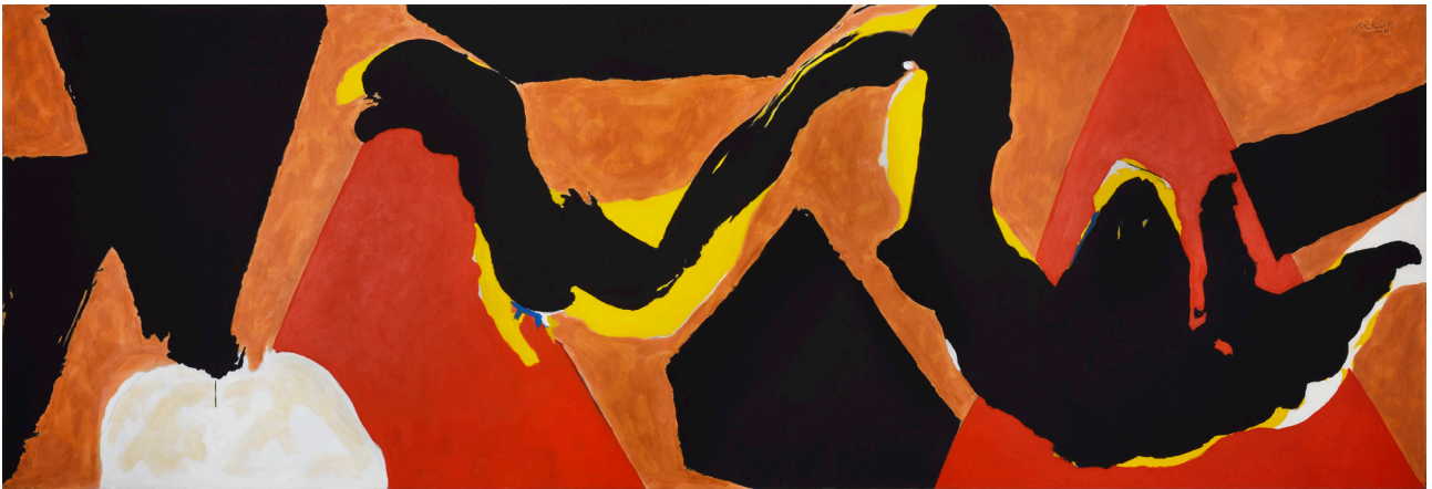
Robert Motherwell, Arabesque , 1989