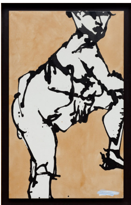
David Smith, Iron Woman , 1964