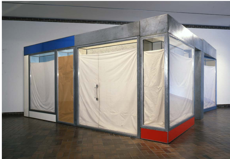
Christo, Four Store Fronts Corner (Parts IV, III, II and I) , 1964-65

Paradeplatz 2 & Talstrasse 37 8001 Zurich, Switzerland