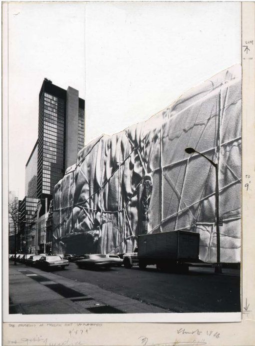
Christo, The Museum of Modern Art Wrapped , 1968