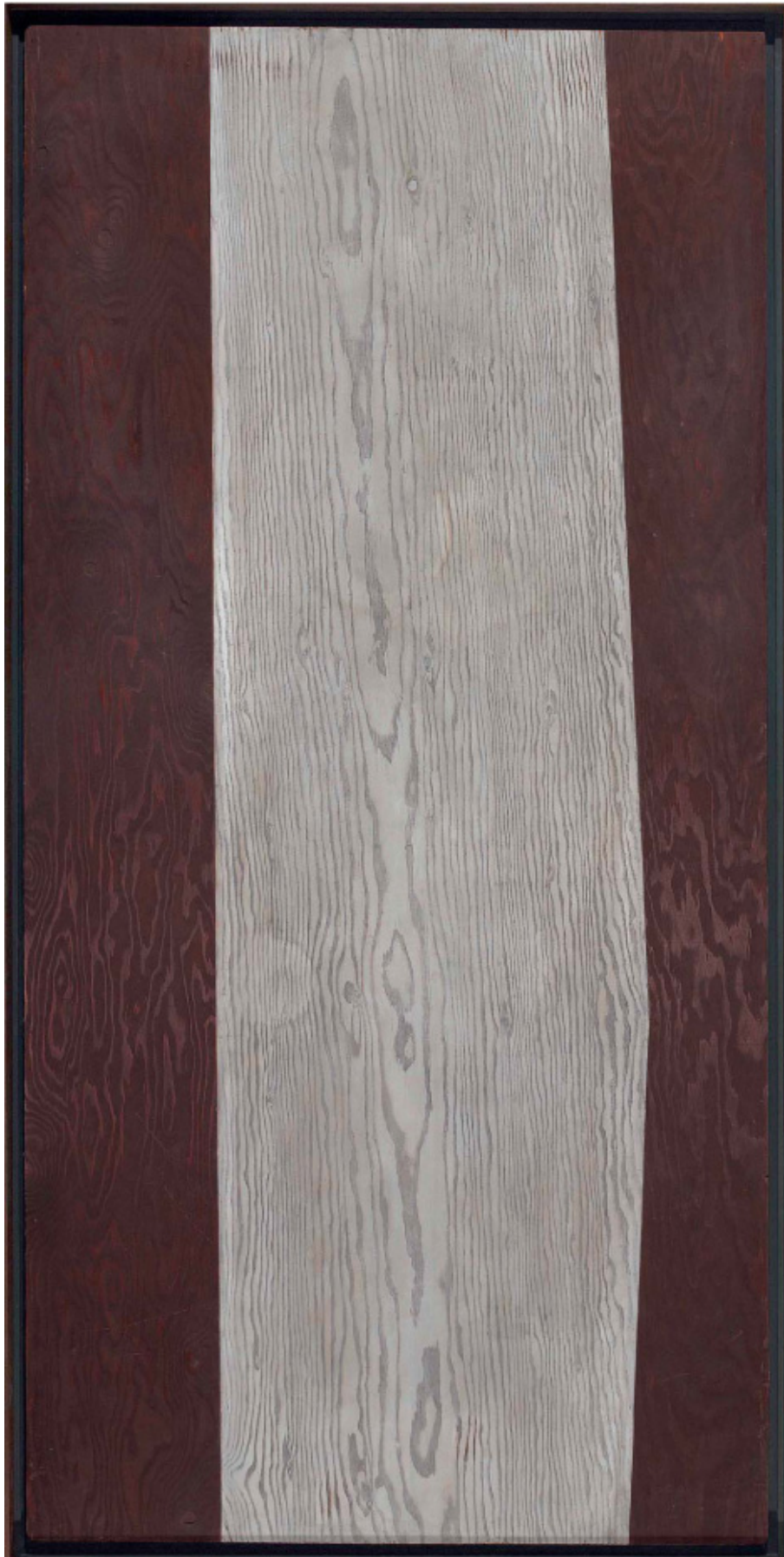
ROBERT INDIANA Slip (Silver Plinth) 1959