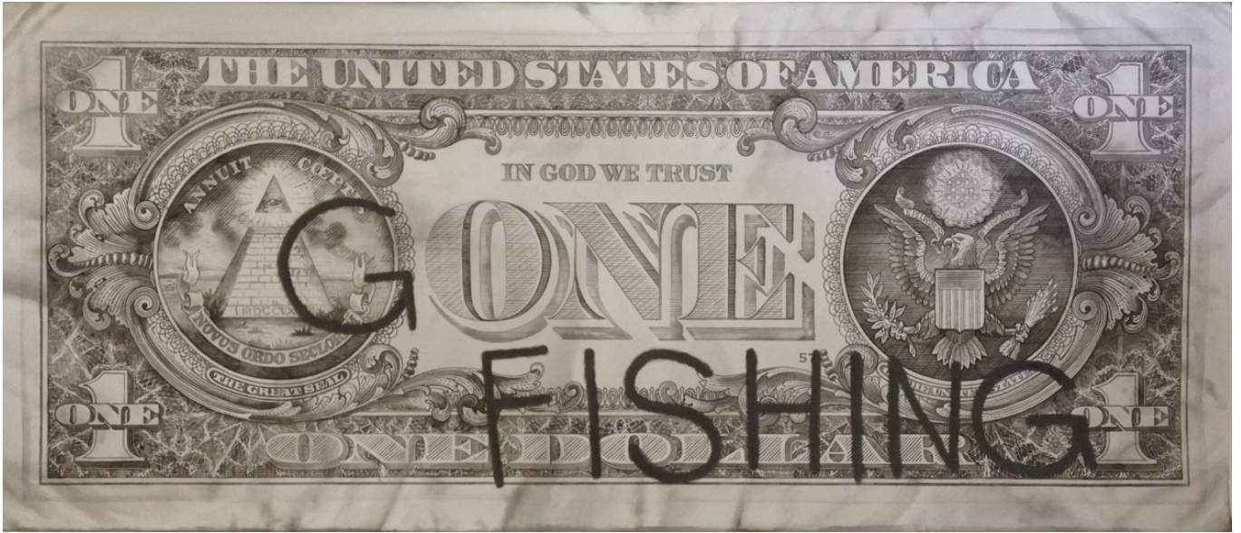
SCOTT CAMPBELL Gone Fishing 2013