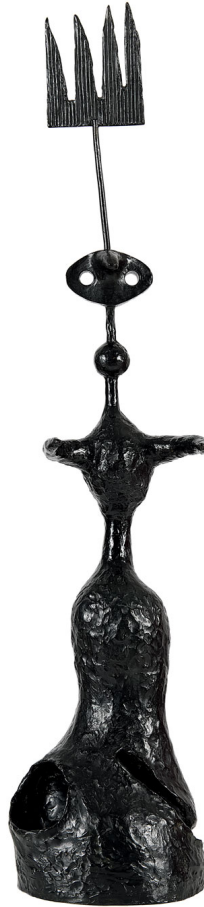
Left: Joan Miró, Miró's Chicago (initially The Sun, the Moon and One Star ) 1981, Brunswick Building Plaza, Chicago Right: Joan Miró, Projet pour un monument pour la ville de Barcelone , 1967

Galerie Gmurzynska at EXPO Chicago | Booth 401