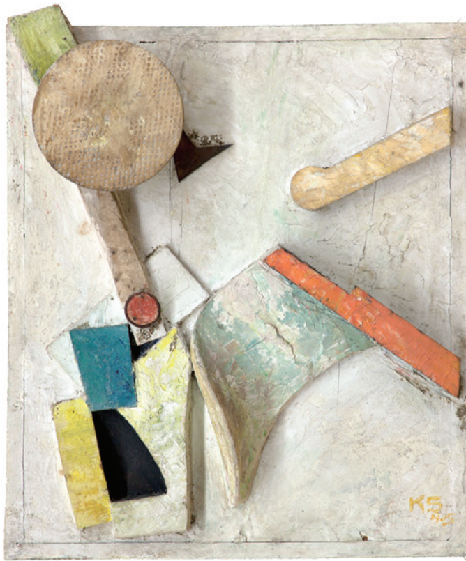
Untitled (Heavy Relief), 1945