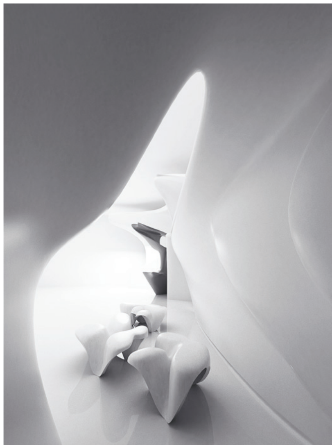
Exhibition design (sketch), Zaha Hadid Design

galerie gmurzynska 20th century masters since 1965 www.gmurzynska.com