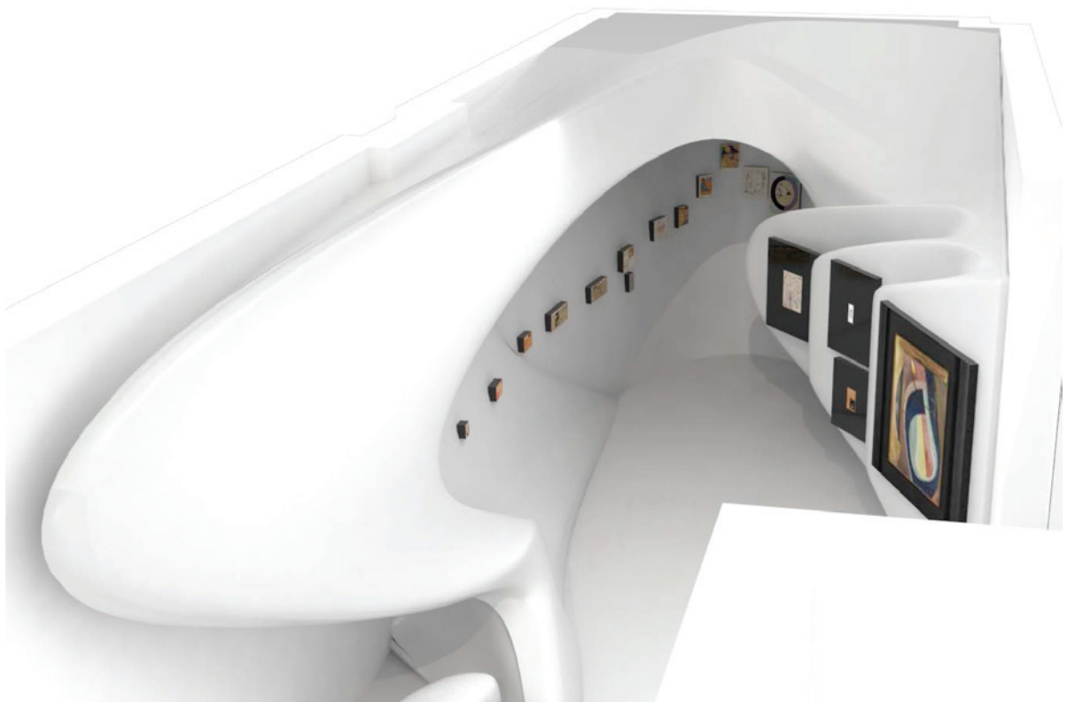
Exhibition design (sketch), Zaha Hadid Design

There is no artist working today that has not been influenced by Kurt Schwitters Norman Rosenthal