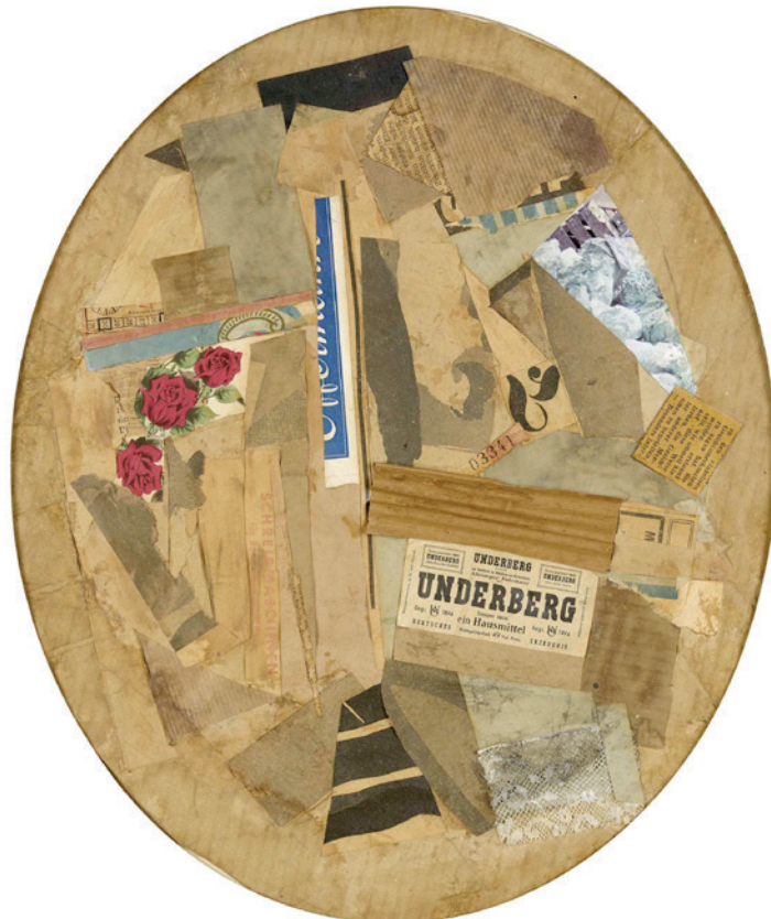
Untitled (Oval), 1925/26