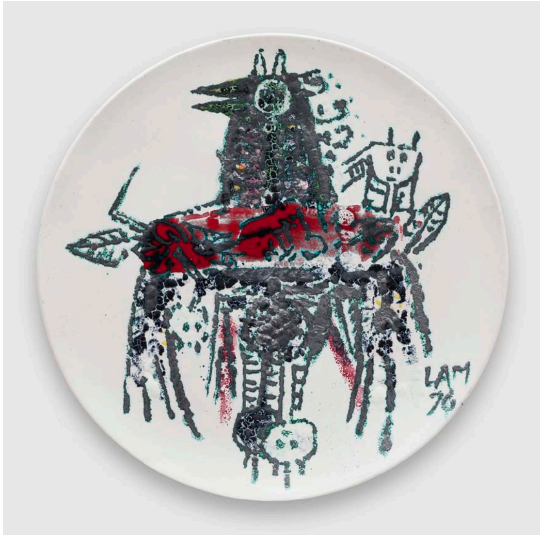
WIFREDO LAM, Balancier ailé, 1976 Terracotta and enamel, Diameter: 51 cm. Unique

galerie gmurzynska 20th century masters since 1965 www.gmurzynska.com