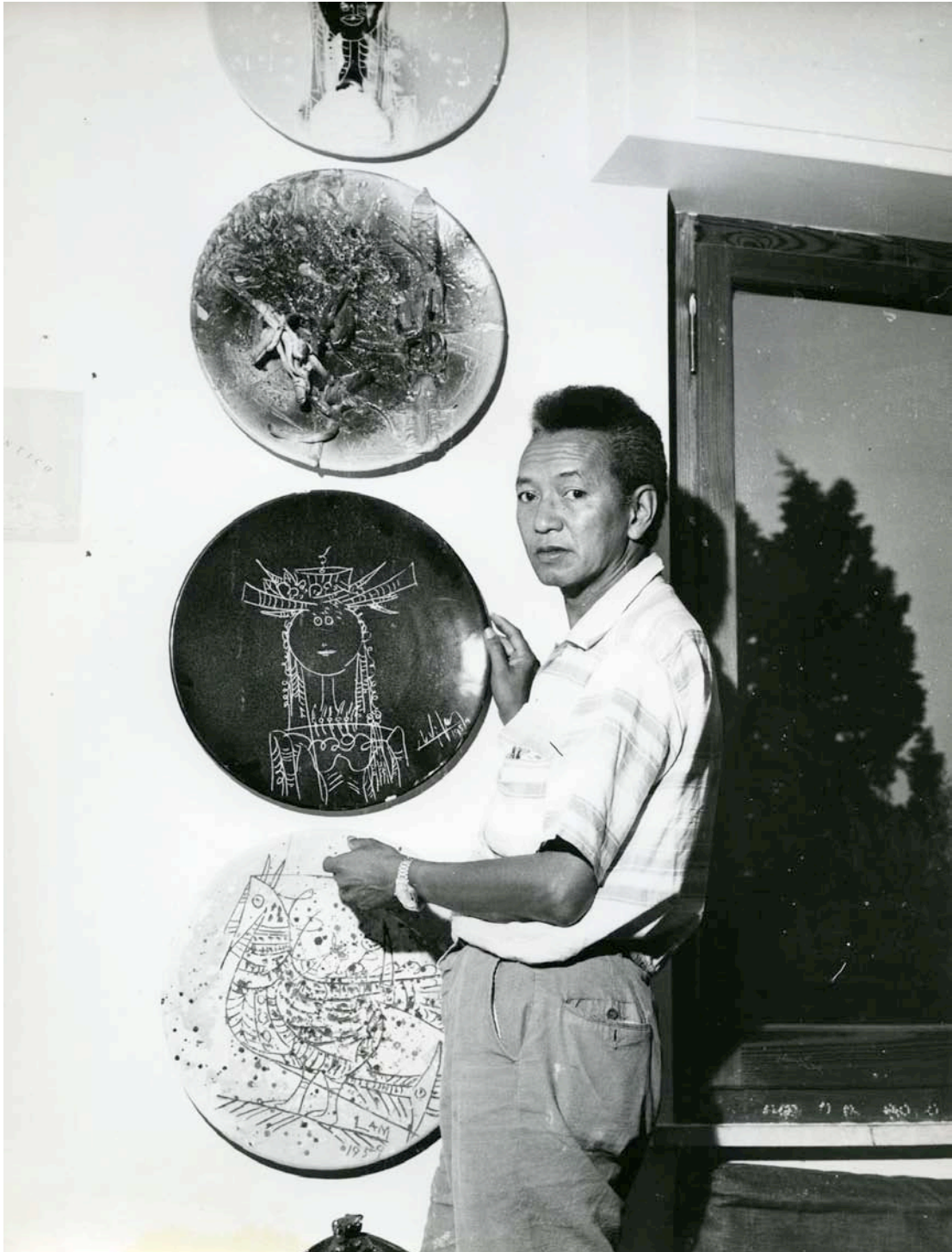
Wifredo Lam in Albissola, ca. 1960

galerie gmurzynska 20th century masters since 1965 www.gmurzynska.com