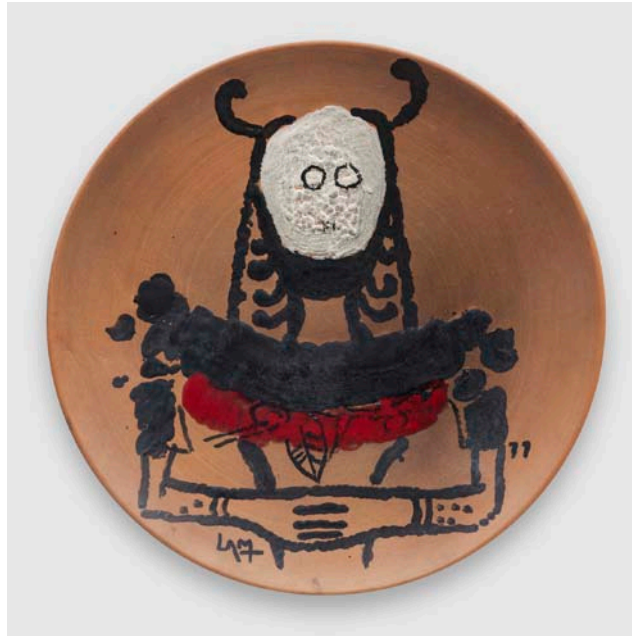
WIFREDO LAM, Tous les possibles, 1977 Terracotta, Diameter: 52 cm. Unique