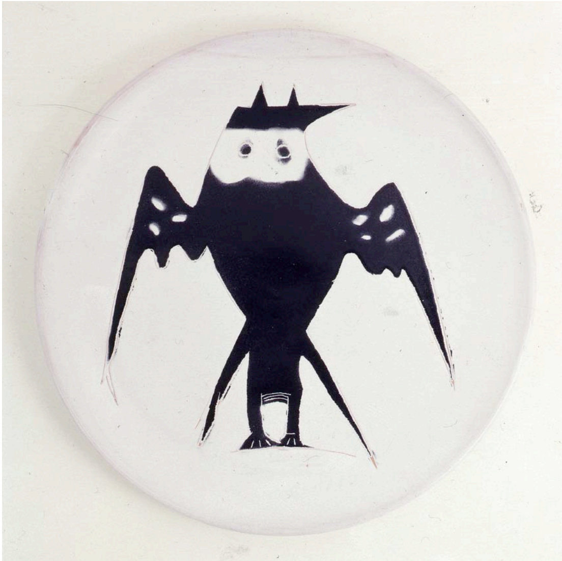
WIFREDO LAM, Chauve-Souris, 1975 Terracotta and enamel, Diameter: 52 cm. Unique

galerie gmurzynska 20th century masters since 1965 www.gmurzynska.com