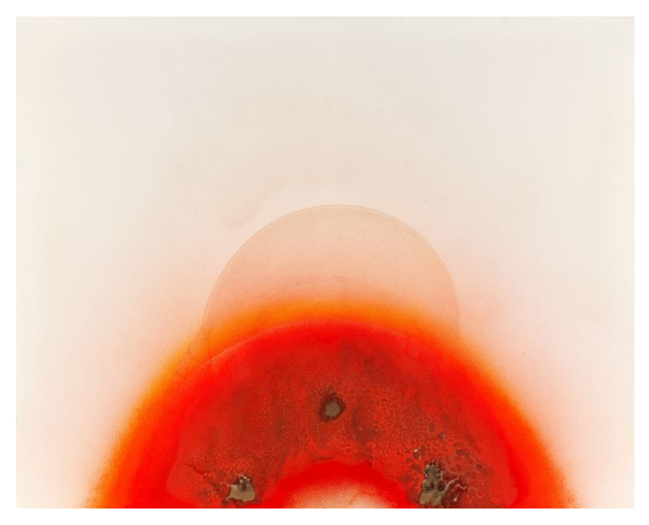
Otto Piene - The Birth of the Raibow, 1966.

Rouge at noir will showcase the artist's most recent series as well as works from the early part of his career. Among the selected pieces are Die Geburt des Regenbogens (The birth of the rainbow, 1966), oil on canvas with fire and smoke; Feuerorgel (Fire Organ, 1972), a painting of fire on cardboard, and Lichtraster o.T (Light grid, untitled) (2012–2014), a light installation. "Light was the uniting, overarching element in the art that my friends and I made," Piene once explained.