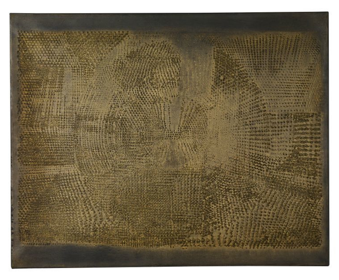
Otto Piene - On the History of Light, 1959.

Throughout his career and in collaboration with other artists from the movement, Piene explored diverse and innovative ways of visual creation in order to reinvent art, using fire, steel, ceramic, kinetic installations, film, sky art, and performance.