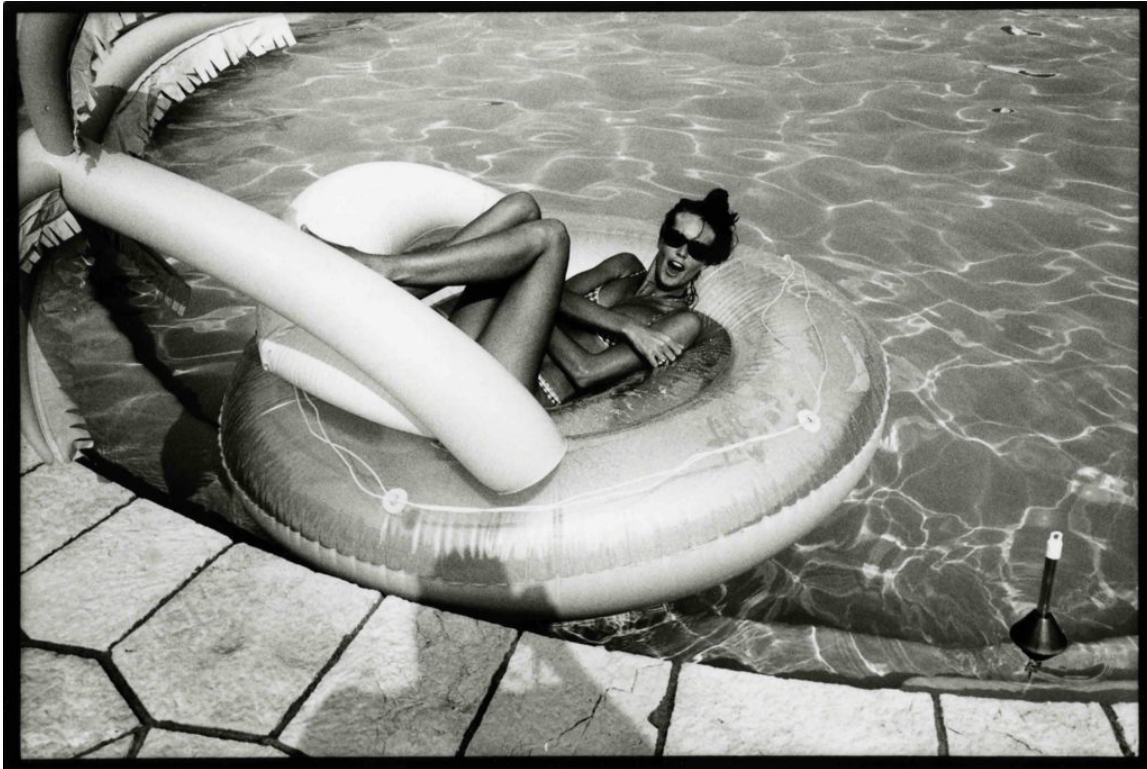
Jean Pigozzi, Elle Macpherson (1991).

Photographer Jean Pigozzi was born rich. The child of Henri Theodore Pigozzi, the founder of the French carmaker Simca, he first started taking pictures as an adolescent and began to develop a candid style, capturing the well-off as he saw them, in private and at leisure. He was born in 1952, a year before his parents built a pool at their home in Cap d'Antibes. "I have spent every summer for the last 64 years at that pool," Pigozzi told us in an interview over Skype. Images from those summers around that pool are the focus of a show, "Pool Party in the Snow," which opens February 19 at Galerie Gmurzynska St. Moritz, featuring a selection of photographs that Pigozzi took of his famous friends over the years, including Elizabeth Taylor, Jack Nicholson, and Sharon Stone.