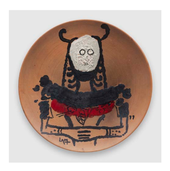
WIFREDO LAM, Tous les possibles, 1977 Terracotta, Diameter: 52 cm. Unique

20th century masters since 1965 www.gmurzynska.com